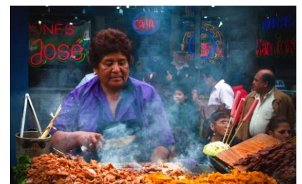
LIMA DOWNTOWN FOOD WALKING TOUR