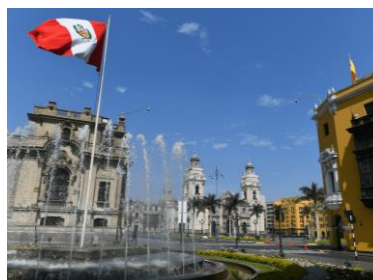
CENTRO DE LIMA WALKING TOUR