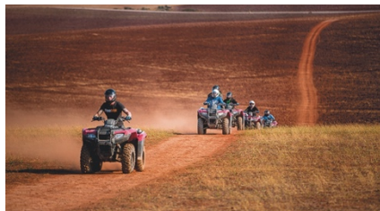
ATV MARAS & LAKE