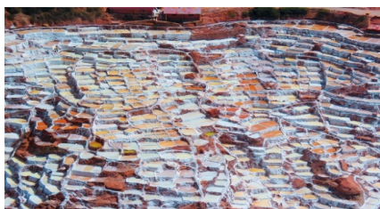
ATV MARAS & MORAY