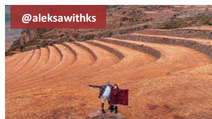
SACRED VALLEY CLASSIC